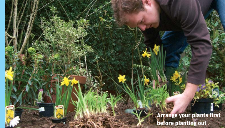
Arrange your plants first before planting out